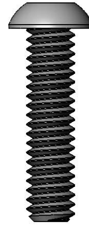
1/4-20 x 1" Button Head Cap Screw